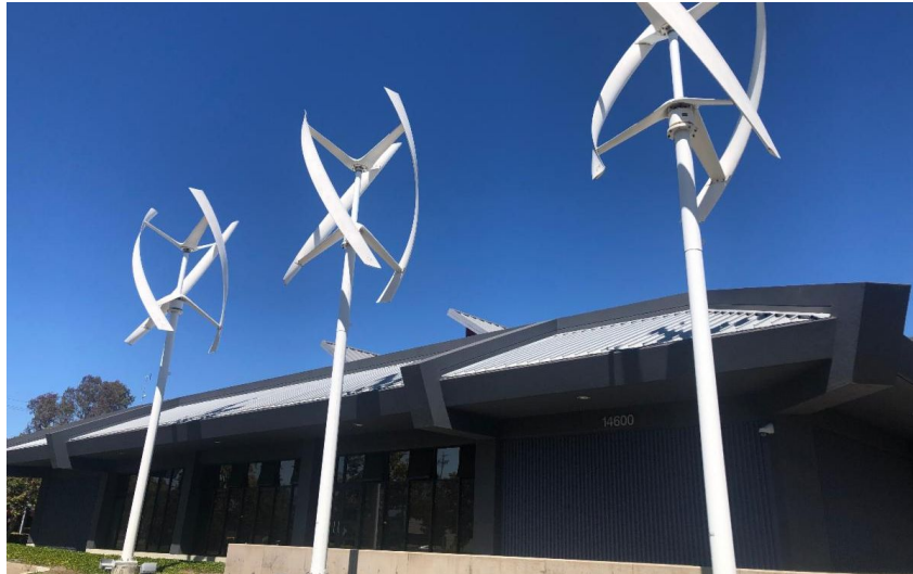
IBEW 595 Alameda County Electrical JATC

We are starting off the new year with some exciting news. After months of collaboration and partnership with CTWI, IBEW 595 has revised their JATC standards to allow for expedited entry of MC3 pre-apprenticeship graduates! This means successful graduates from MC3 pre-apprenticeship programs can now skip the IBEW 595 entrance exam and proceed directly to interviews.