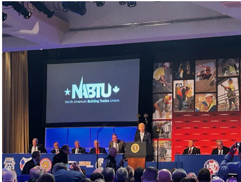
President Biden at 2023 North America's Building Trades Unions National Conference

We kick off the month of May celebrating International Workers Day - a tribute to organized labor, collective bargaining, and our high-caliber Union apprenticeship programs. The union model is a 100-year-old system that is proven to get the work done with a high degree of quality, while simultaneously uplifting millions of Americans to the middle class. Unions are synonymous with High-Road; they are the best pathway to the American Dream.